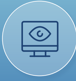
SECURITY AWARENESS TRAINING